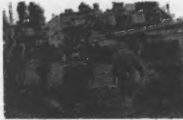
Israeli tanks mass at the Gaza border. There are fears Israel could get lured into a costly ground war.