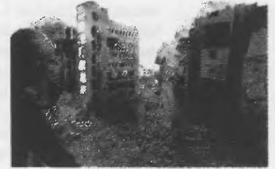
A Palestinian man looks at the government ministry compound in Gaza City, which was hit by Israeli air strikes.

In conference calls, one-on-ones with reporters, and press releases, Jewish groups and Israeli diplomats alike reminded the