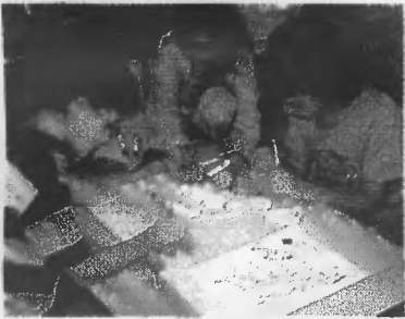
Students at the Hannah Senesh Community Day School in Brooklyn. Their parents, and others, could get $5,000 toward tuition.

The $1 million in scholarships, to be awarded next year based on need, will be granted through the 280 yeshivas and Jew-