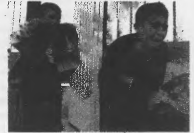
Israeli children react to a rocket attack in Ashkelon. Anxiety is palpable in the seaside city.

Toward Inclusion: A New Dialogue on Disabilities